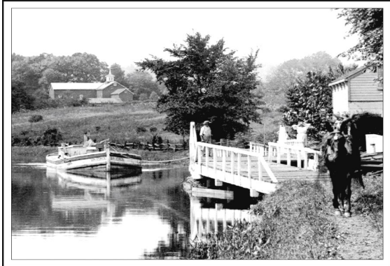
Delaware & Raritan Canal, Titusville

The Historical Society was formed in 1975 by a group of citizens interested in preserving the rich heritage of Hopewell Valley