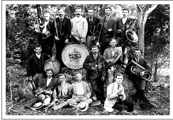
Hopewell Cornet Band c1890

We publish an award-winning newsletter four times a year that includes well-researched articles about Hopewell Valley history, and news and events of the Society.